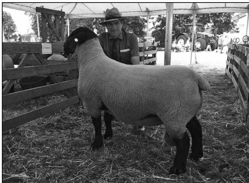
Longer docks at 2016 ag show in Essex, England.